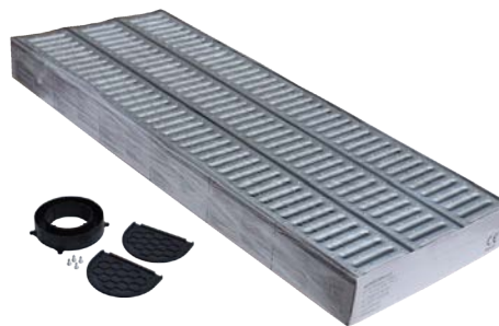
- Garage Pack