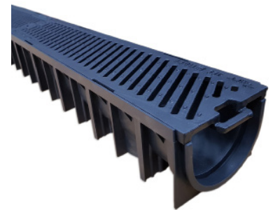
- 4ALL B125 ductile grating